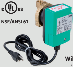
Wilo Z-15 DHW Re-Circulation Pump