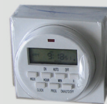
timer sold separately